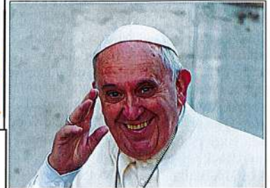
Pope Francis, we pray for you!

THANK YOU FOR YOUR SUPPORT DURING THE CHRISTMAS SEASON!