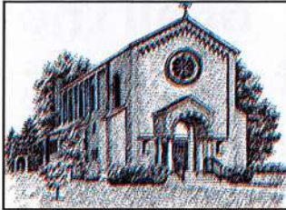
Located at: 10 Church Street Phelps, NY 14532