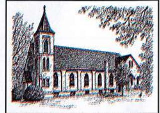
Located at: 97 West Main Street Shortsville, NY 14548