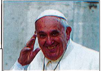
Pope Francis, we pray for you!

THANK YOU FOR YOUR SUPPORT DURING THE CHRISTMAS SEASON!