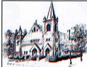
Located at: 12 Hibbard Avenue Clifton Springs, NY 14432