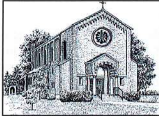
Located at: 10 Church Street Phelps, NY 14532