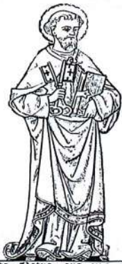
† Sancte Petre ora pro nobis †