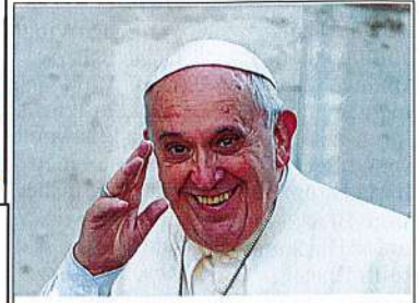
Pope Francis, we pray for you!

TRADITIONAL FUNERALS – CREMATION SERVICES