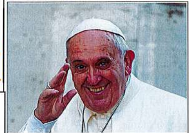
Pope Francis, we pray for you!

TRADITIONAL FUNERALS – CREMATION SERVICES