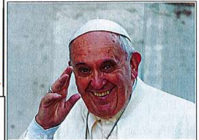
Pope Francis, we pray for you!

THANK YOU FOR YOUR SUPPORT DURING THE CHRISTMAS SEASON!