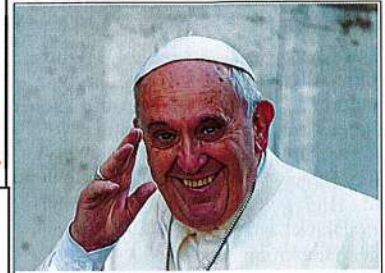
Pope Francis, we pray for you!

THANK YOU FOR YOUR SUPPORT DURING THE CHRISTMAS SEASON!