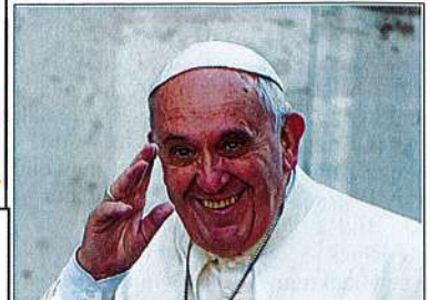
Pope Francis, we pray for you!

THANK YOU FOR YOUR SUPPORT DURING THE CHRISTMAS SEASON!